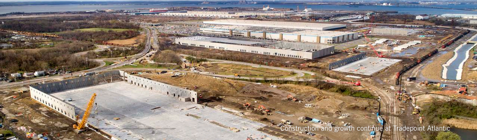
Construction and growth continue at TradePoint Atlantic